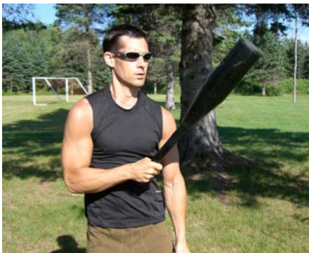
How to Obliterate Your Competitors, Skyrocket Your Income and Magnetically Attract More Clients with the Clubbell® – The #1 "Hand-Held Health Club" for Pain-Free Power, Fat-Free Fitness and Injury-Free Prehab

loud music, books, television, anything to distract their nervous system from the insane tedium of the monotony. Instead, swinging weights like my Clubbell® allow you to express your strength in 3 dimensions, and create real usable strength not just for enhanced sports performance but for functional applications in all fields of life. You don't have to spend years learning how to swing an axe, sledgehammer, shovel or club because the template is written into our very DNA. Swinging weights is absolutely the most genetically connected, and fun way you can maintain and grow your fitness.